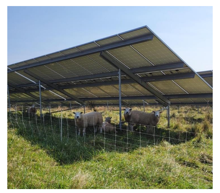
Figure 1. An example of a solar grazed site.

This study was conducted to compare pasture quality and soil health at commercial solar sites with and without sheep grazing for vegetation management. This study was performed at 28 grazed solar sites and 3 non-grazed sites with sample collection beginning in Spring 2022 and completed Summer 2024. The sites were located primarily in New York with a total of 25 sites in the state, but also included 3 locations in Pennsylvania, 2 locations in Connecticut, and 1 location in Massachusetts. The sites ranged from 1.42 to 15.38 hectares (ha), with one site being 40.06 ha. 29 sites used fixed panels while the remaining 2 sites used single-axis tracking panels. Sites were constructed between 2015-2020. The majority reported prior land use of the sites was croplands (including hay and corn), followed by open fields (including fallow land), and finally woodlands. When selecting sites, graziers were sought out who were already solar grazing as a form of agrivoltaics. As such, the solar sites were constructed for the purpose of energy generation, with local graziers later joining the operation to create agrivoltaic sites, allowing for this baseline research to take place. Sites were selected by their ability to contribute to the knowledge base over the duration of the study, provide relevant information about innovative co-location strategies and the willingness of all parties involved in the solar site maintenance to share information.