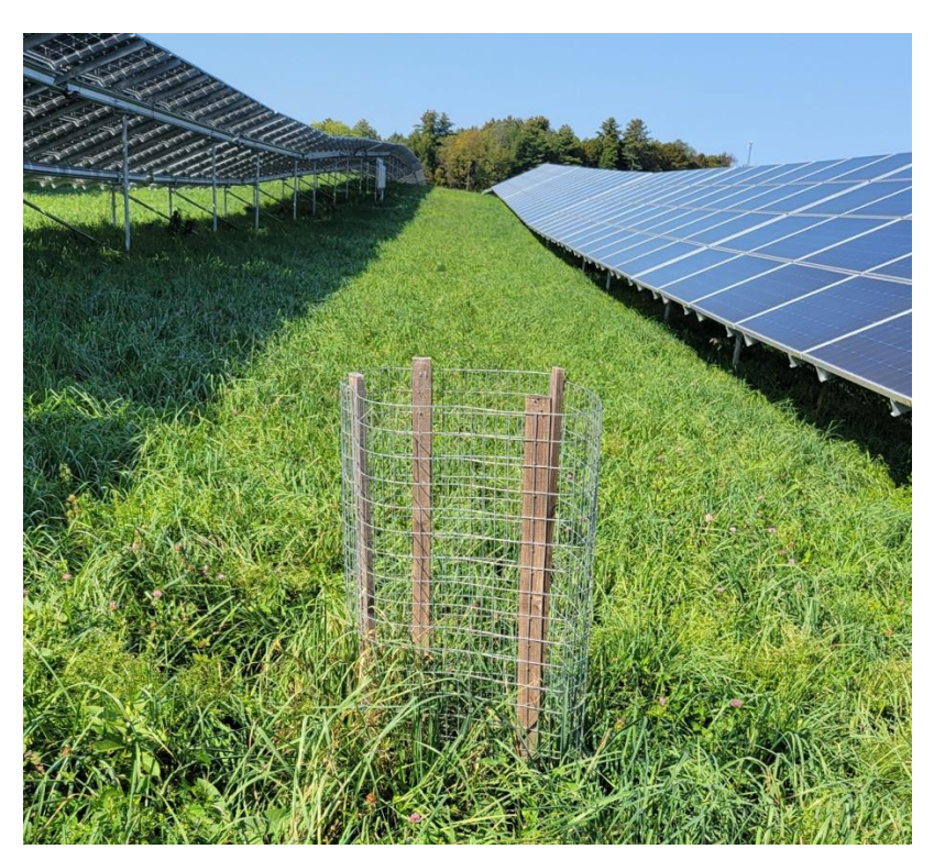
Figure 2. An example of an exclusion cage.

Two individual exclusion cages measuring 60.96 cm were placed at each grazed and nongrazed site with one in the UP treatment and one in the OS treatment ( Figure 2 ). These cages served as controls to the portions of the solar site that are grazed to compare the relative productivity between grazed and non-grazed sites. The cages were harvested in the summer and fall of each year by using electric shears or harvest knives to cut the forage to 7-10 cm above soil level. The sample was then weighed and sent to Dairy One Forage Laboratory to undergo forage analysis [8]. Following harvest, a new area was pre-cut and the exclusion cage was re-installed to prepare for the next sampling date.